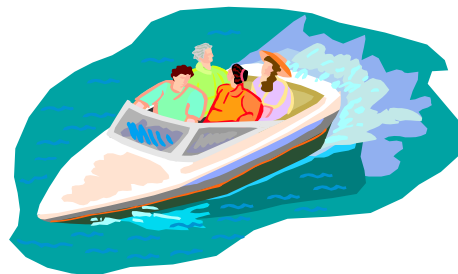
49 Esprit De Soleil Yanmar Marine Power Boat: $49,000 $816/month for 5 years