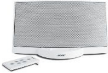
Bose Sound Dock: $240 $20/month for a year