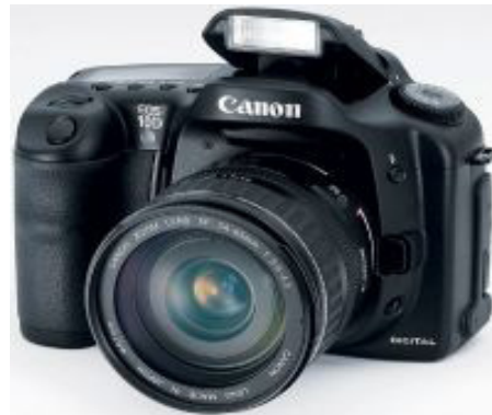
Canon Digital Camera: $450 $37.50/month for a year