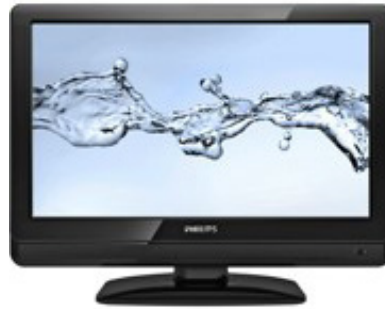
Phillips 22" Flat Screen HDTV: $240 $20/month for a year