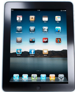
Apple iPad: $525 $43.75/month for a year